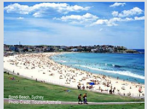
Bondi Beach, Sydney

Transfer to Cairns airport for your next destination or the journey home.