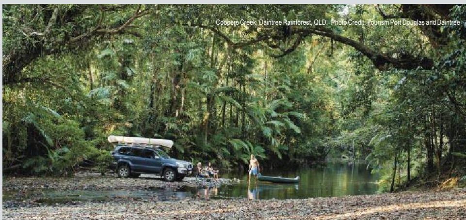
Coopers Creek, Daintree Rainforest, QLD.

Enjoy a day trip to the beautiful Phillip Island. It has a rugged surf coastline with many sheltered beaches and it's here that you will get to enjoy the sights and sounds that make this part of the world a unique haven for Australian wildlife. Experience Moonlit Sanctuary, Churchill Island, Cape Woolamai and the highlight of course the Penguins at dusk. Amongst all the excitement you'll get to enjoy a BBQ lunch as well.