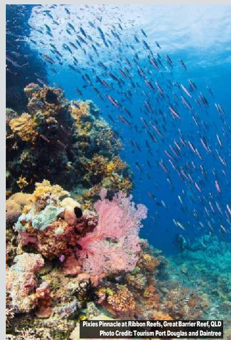
Pixies Pinnacle at Ribbon Reefs, Great Barrier Reef, QLD

Say goodbye to Port Douglas as you're transferred to the airport for your next destination.