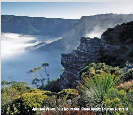
Jamison Valley, Blue Mountains, Photo Credit: Tourism Australia

This morning you'll be picked up early to venture into the World Heritage listed Blue Mountains region. Begin your day by getting up close with the Koalas at Featherdale Wildlife Park before your guide will take you off the beaten track to see some of the iconic views and stunning waterfalls that this region is famous for. Enjoy a delicious 2 course lunch in the village of Blackheath as well as a glass of sparkling to end the day at Mt Tomah Botanic Gardens.